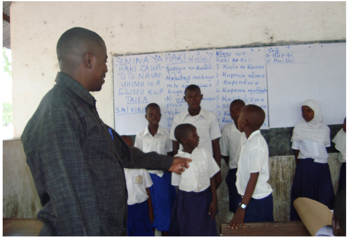
Annex 1: Students and Teachers Photos CRC Training at White Angels Primary school; Photos A -C Photo A